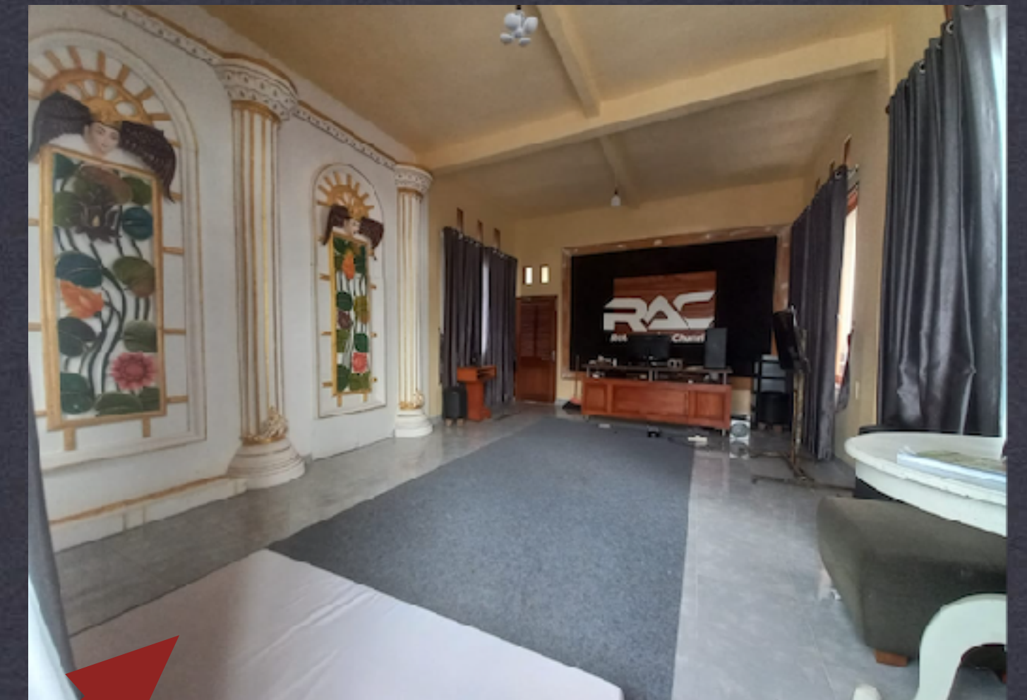
Class Room on the 2nd floor