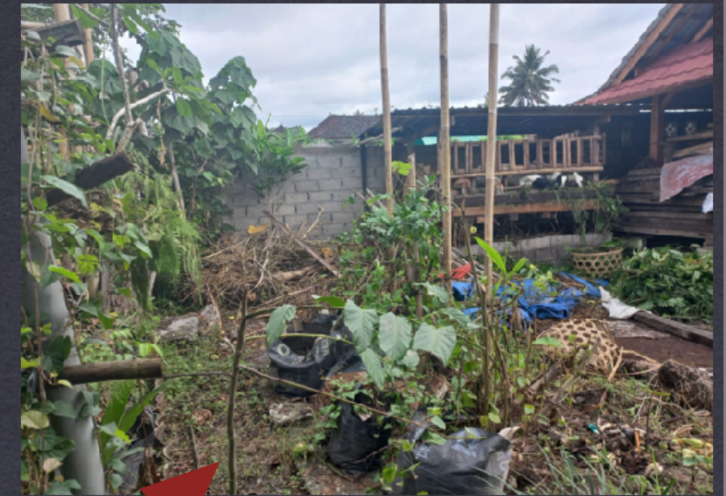
Worm Farm & Composting area