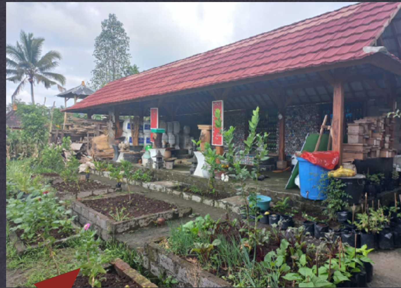
Vegetable garden area