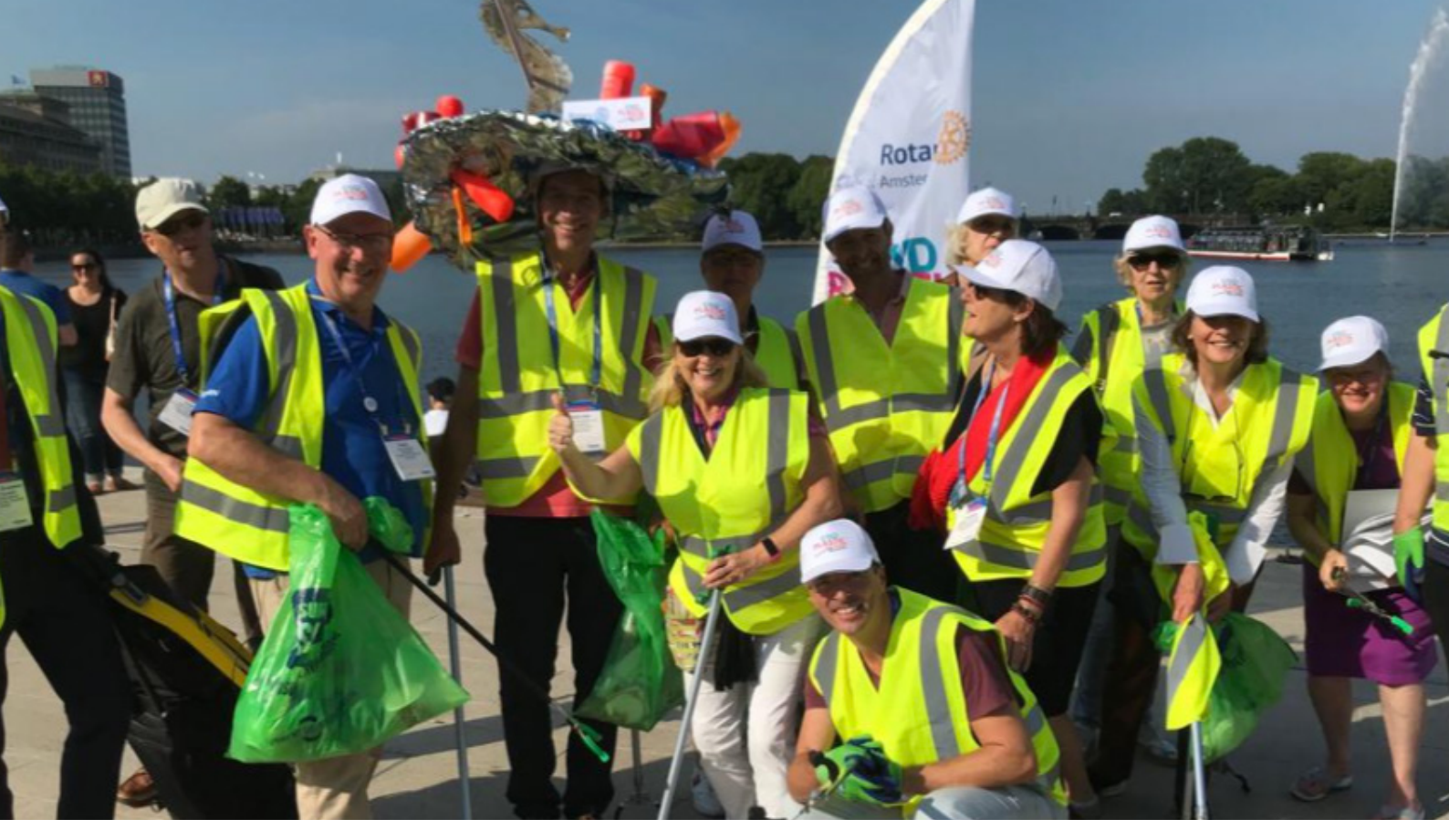
EndPlasticSoup in action - Rotary International Convention Hamburg June 2019