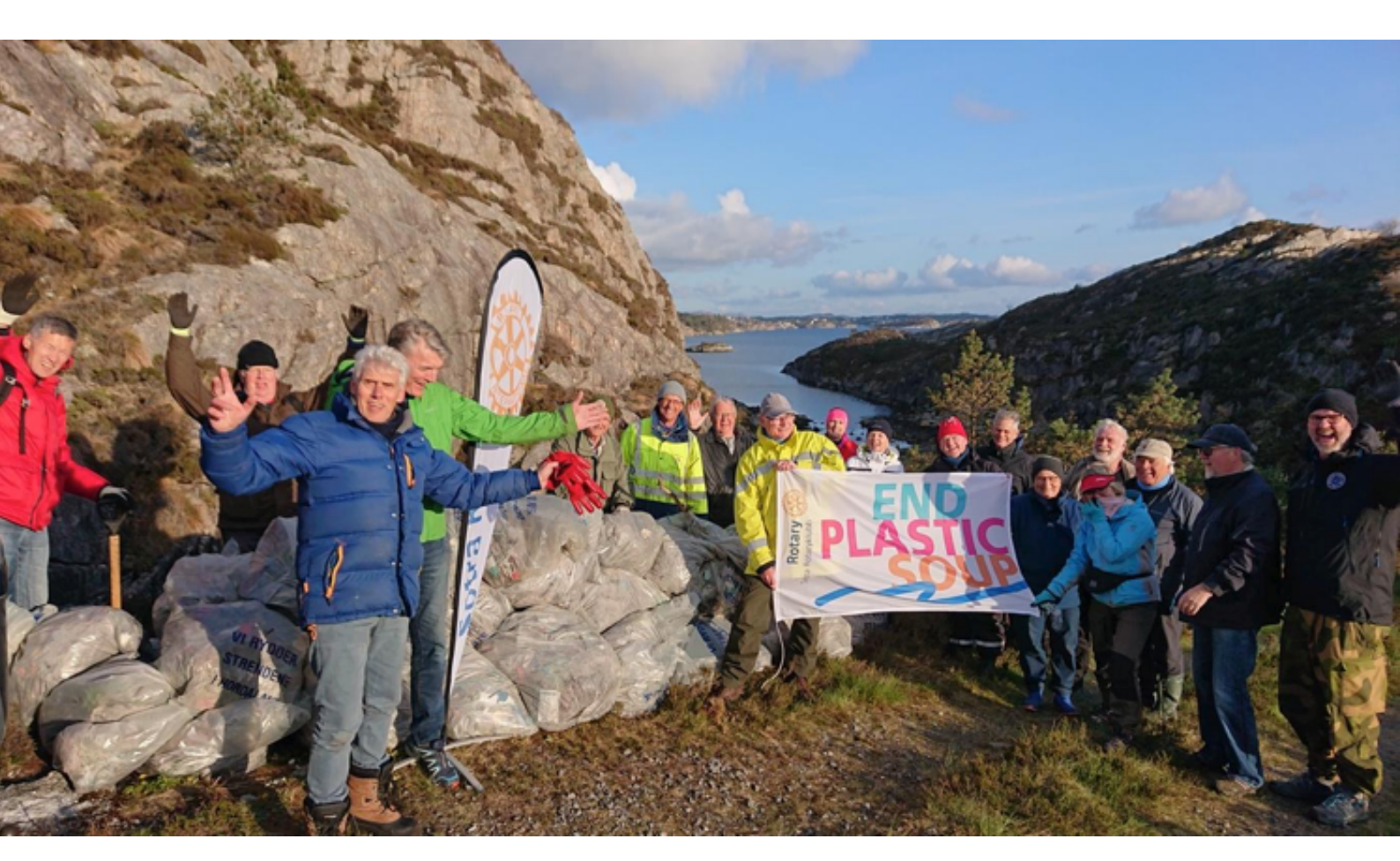
First EndPlasticSoup Ambassador and Member Club RC Sotra, Norway